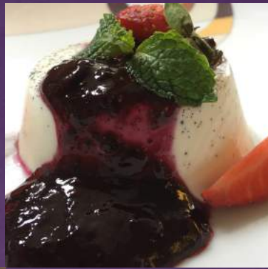
PANNA COTTA WITH MIXED BERRIES