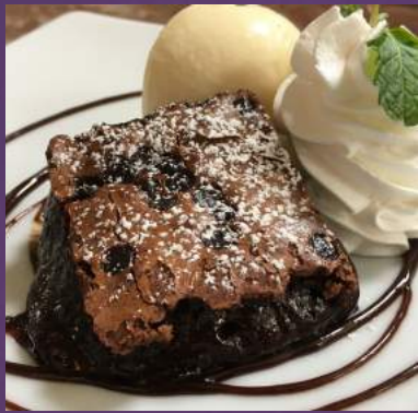
SUPER STICKY BROWNIE